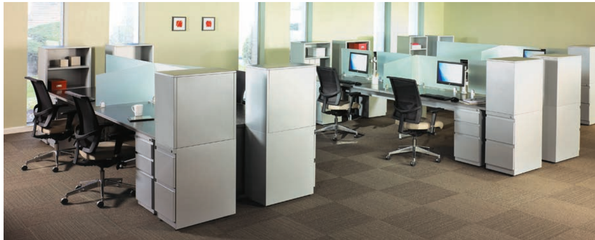
Clockwise from top: Santa Cruz® Lounge Seating in Black leather and Sorrento Occasional Table in Espresso enhance the reception area. All TransAction workstations feature Luna Night worksurfaces and Mist paint. Dual-sided quad stations and single-sided L stations complement 120° pods and maximize planning flexibility.