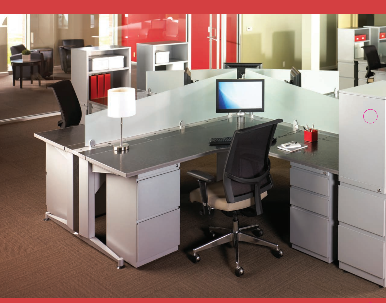
Triple Play. TransAction 120° 3-Pod Workstation with Data Access Channels, Power Kits, Monitor Supports, Pedestals and Storage Tower. Acrylic Privacy Screens have been customized to a taller height than our standard 12 inches. Commute™ seating is used throughout the space.

In December 2012, Mayline installed 35 TransAction™ workstations and other furniture at Motion Industries in Madison Heights, Michigan.