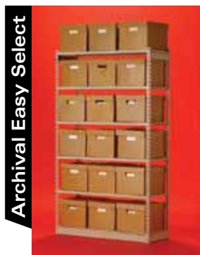
Archival Easy Select