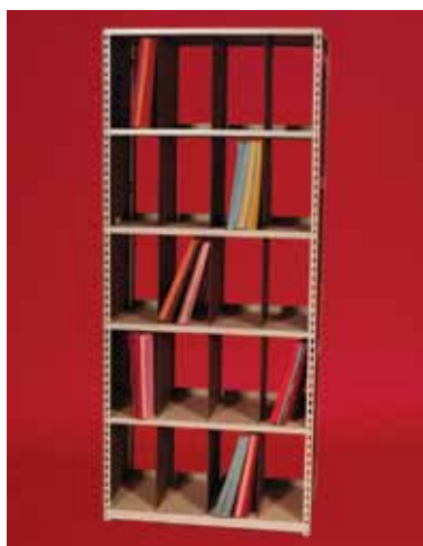
X-Ray & Mammogram