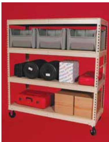
Widespan Shelf Truck