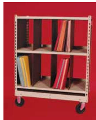
Radiology File Cart