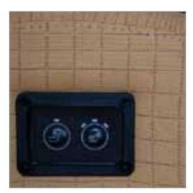
Heat & Massage

Operated through pushbutton control located on inside of arm (not available on pillow back models).