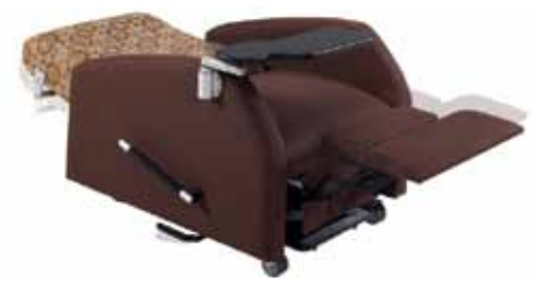
Trendelenburg Tilt Feature

Offers a negative 3 degree pitch from the full flatbed position*