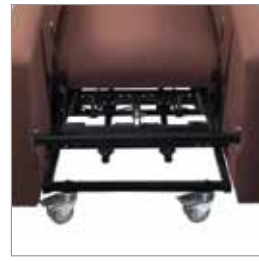
High-Carbon Steel Frame

Delrin bushings at critical wear points. Wear-tested at 50,000 human occupant cycles.