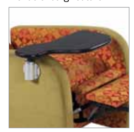
Tablet Arms Select from two optional

Optional brushed aluminum foot rest lever with black textured grip to replace standard black lever. Hands free foot pedal to activate Trendelenburg feature.