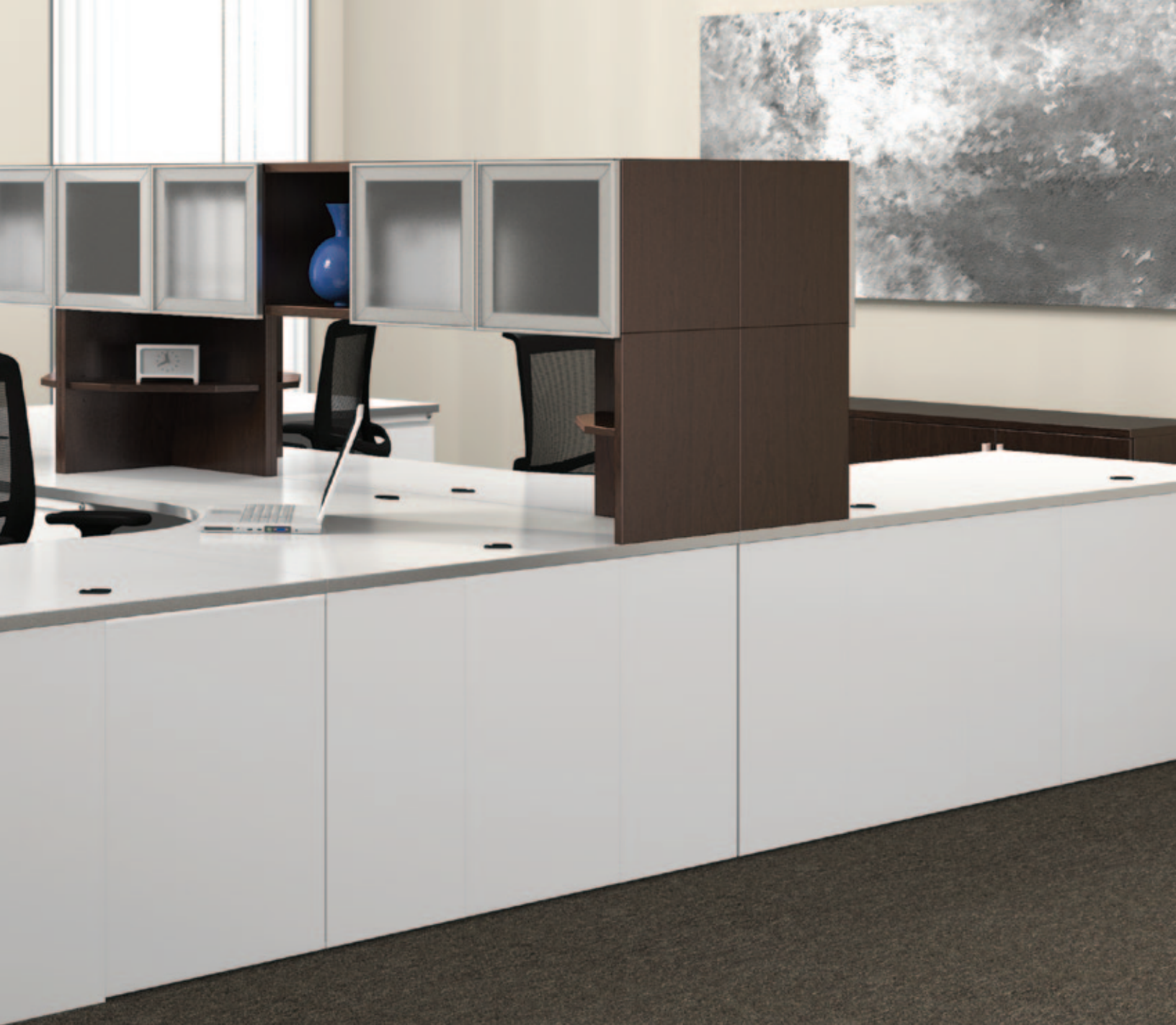
"J" Tables, Returns and Pedestals in White Paint with Designer White laminate worksurfaces and Silver edge band. Overhead Cabinets, Corner Supports and Storage Cabinets in Columbian Walnut. Commute™ Chairs with Chrome base, Black mesh back and Expo Sky fabric.