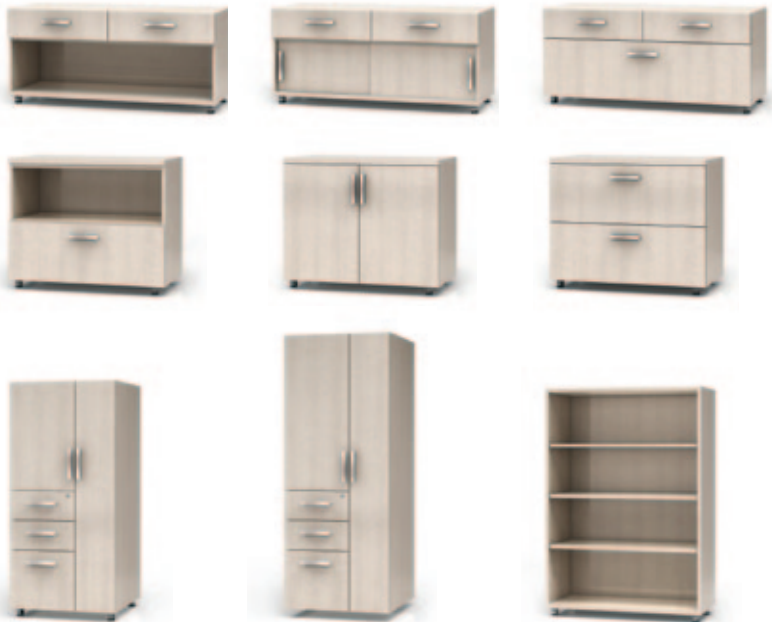
Laminate storage components are available in the six colors shown below and even more configurations than you see here.

PO Box 9606 Wichita, KS 67277 316 942-4100 tom@teberry.com