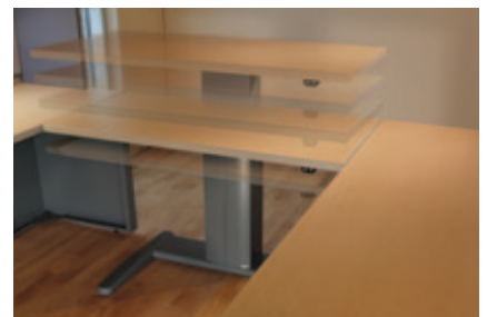
Freestanding Height-adjustable Desks promote healthy movement throughout the day.