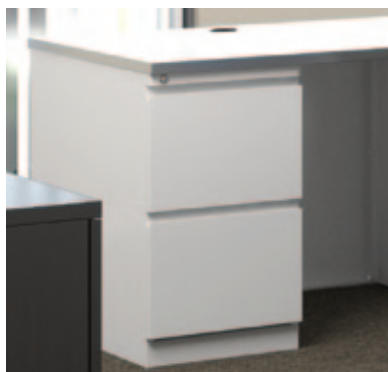
Pedestals (and Table Legs) are non-handed to simplify specifying and installing.