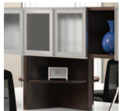
Corner Support Modules (with shelves) securely support Overhead Cabinets.