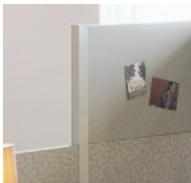
Fabric Panels can be stacked and ganged to create many unique combinations.