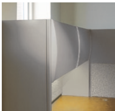
Desk-mounted Hutches feature elegant radius-front Overhead Flipper Doors.