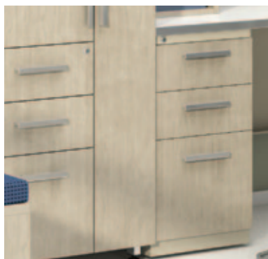
Laminate storage components add warmth and dimension to your CSII station.