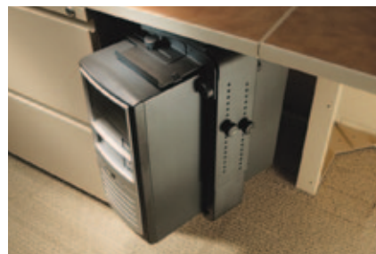
A CPU Holder is one of many support products that makes users more productive.