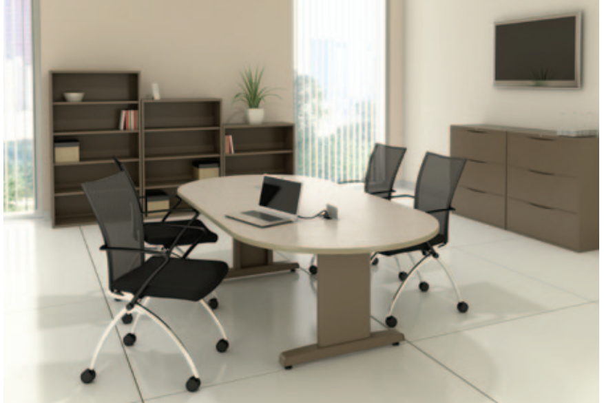
Conference Table, Lateral Files and Bookcases in Sand Beige Paint with Classic Rock laminate conference surface. Valoré TSH1 Chairs with Black mesh back and fabric seat.