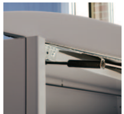
"Soft Close" system provides safe, secure and quiet closure of Flipper Doors.