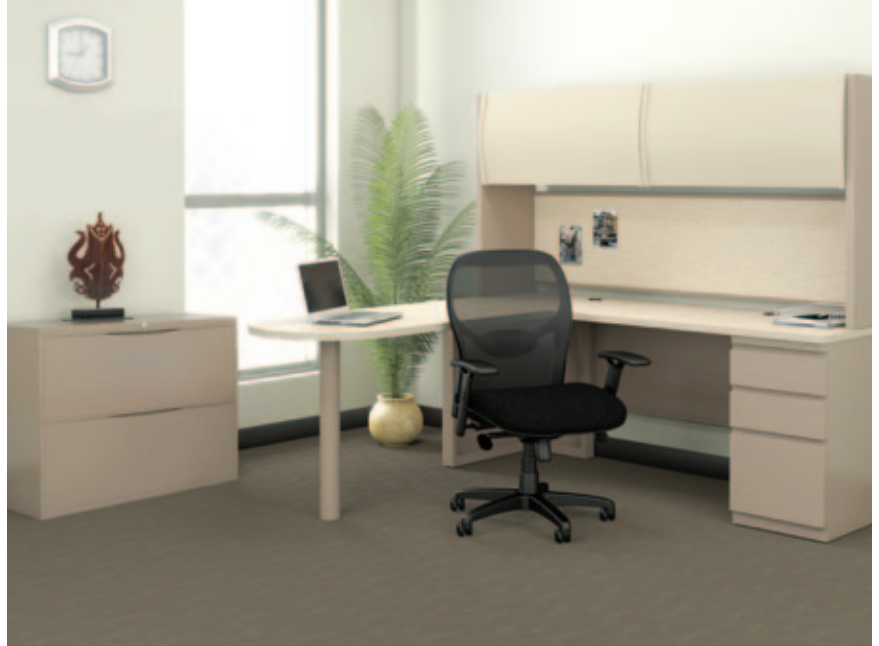
Peninsula Table, Credenza with Pedestal and Overhead Flipper Door in Warm White paint with Classic Rock laminate worksurfaces. Mercado Series 3200 Chair with Black fabric seat and mesh back.