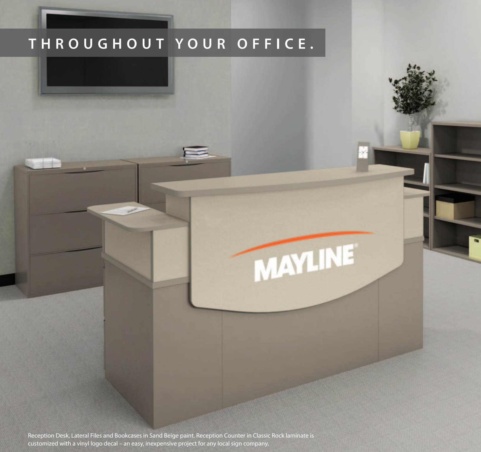
Reception Desk, Lateral Files and Bookcases in Sand Beige paint. Reception Counter in Classic Rock laminate is customized with a vinyl logo decal – an easy, inexpensive project for any local sign company.

CSII enables you to create a unified look, feel and function throughout your organization. Reception desks, conference tables, lateral files, bookcases and other storage components complement our workstation products – and deliver the same long-lasting durability and attention to design detail.