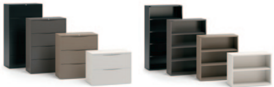
Steel files and bookcases align dimensionally with CSII Desking and Hutches.