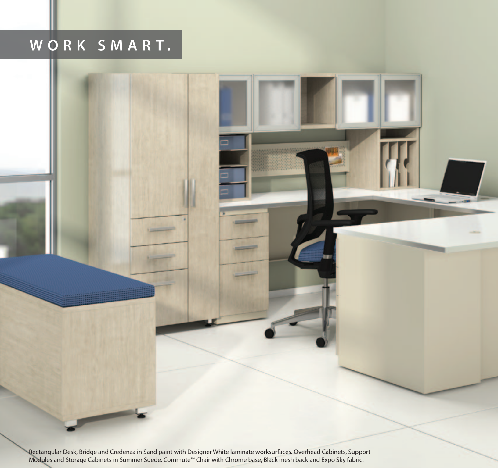
Rectangular Desk, Bridge and Credenza in Sand paint with Designer White laminate worksurfaces. Overhead Cabinets, Support Modules and Storage Cabinets in Summer Suede. Commute™ Chair with Chrome base, Black mesh back and Expo Sky fabric.

CSII includes a number of features that enhance productivity, efficiency and user satisfaction. Expansive desk surfaces provide plenty of room to spread out work. Storage components run the gamut from under-surface to eye-level to overhead, in configurations that suit any set of job responsibilities. Streamlined aesthetics adapt well to the personal touches that make an office more comfortable. It's a smart investment for your workplace and your workforce.