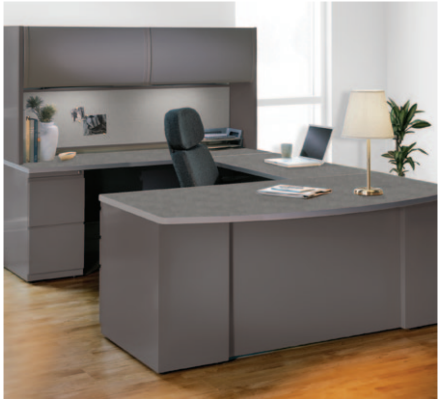
Bowfront Desk, Straight Bridge, Credenza with Pedestal and Overhead Flipper Door in Medium Tone paint with Windswept Pewter laminate worksurfaces. Comfort Series Big & Tall Chair in Black fabric.