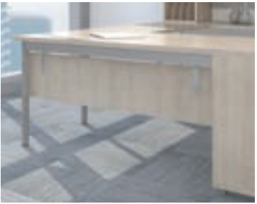
Easy-to-attach acrylic or laminate Modesty Panels are available for all standard configurations.

e5's common-sense approach to building a workspace makes it just as Easy to Specify private offices as collaborative environments. A variety of freestanding and wall-mounted components let you create near-endless configurations, in colors and finishes that range from traditional to ultra-modern. Use e5 throughout your office to create a unified look, feel and function while enhancing your Easy-to-Reconfigure flexibility.