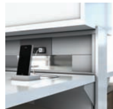
Technology Walls offer arm-level access to power/data plus convenient cable troughs.

Benching applications make extremely efficient use of real estate while promoting collaboration. e5 makes benching even more comfortable and productive with options for standing-height worksurfaces and overhead storage. Worksurfaces cantilever into position and storage components simply slide and lock into place atop our Technology Walls – the load-bearing equivalent of our Technology Beltways. That’s just one of many Easy-to-Install touches!