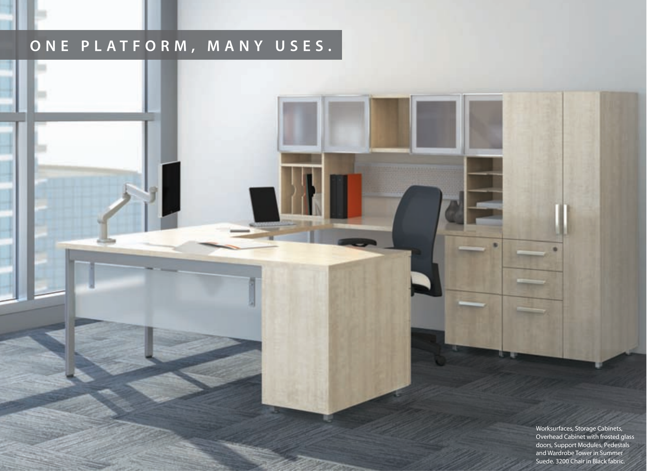
Worksurfaces, Storage Cabinets, Overhead Cabinet with frosted glass doors, Support Modules, Pedestals and Wardrobe Tower in Summer Suede. 3200 Chair in Black fabric.

e5's common-sense approach to building a workspace makes it just as Easy to Specify private offices as collaborative environments. A variety of freestanding and wall-mounted components let you create near-endless configurations, in colors and finishes that range from traditional to ultra-modern. Use e5 throughout your office to create a unified look, feel and function while enhancing your Easy-to-Reconfigure flexibility.