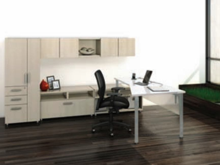
A universal kit of parts eases specification in every area of your floor plan. Worksurface in Designer White. Storage Cabinets, Overhead Cabinet with laminate doors, Support Modules and Wardrobe Tower in Summer Suede. 3200 Chair in Black fabric.