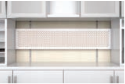
A magnetic Tackboard spans between vertical components to display notes, photos and art.