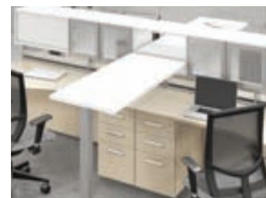
Standing-height Worksurfaces invite collaboration and promote movement.