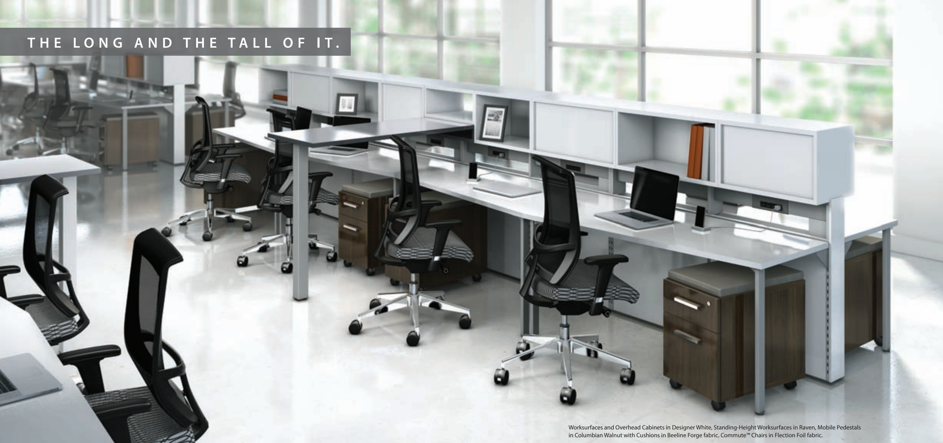
Worksurfaces and Overhead Cabinets in Designer White, Standing-Height Worksurfaces in Raven, Mobile Pedestals in Columbian Walnut with Cushions in Beeline Forge fabric. Commute™ Chairs in Flection Foil fabric.

Benching applications make extremely efficient use of real estate while promoting collaboration. e5 makes benching even more comfortable and productive with options for standing-height worksurfaces and overhead storage. Worksurfaces cantilever into position and storage components simply slide and lock into place atop our Technology Walls – the load-bearing equivalent of our Technology Beltways. That’s just one of many Easy-to-Install touches!