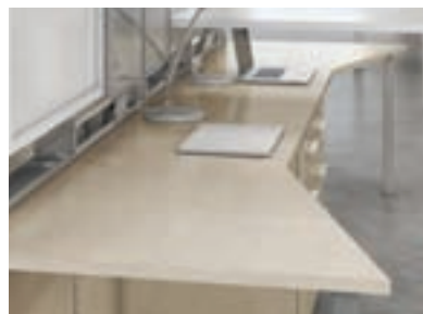
Right- and left-hand Hatchet Worksurfaces provide expanded working space.

e5 is Easy to Afford for even the smallest companies. Because it's also Easy to Reconfigure , adding workers and transforming work environments is a piece of cake. You can repurpose components into entirely new applications and expand office layouts with minimal disruption. Bulk up storage. Diversify function. Add more power, anywhere you want it. Whatever your needs, now and in the future, you can count on e5 for an easy solution.