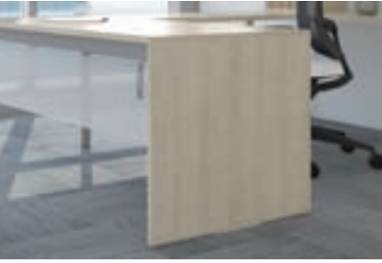
Worksurfaces may be supported by full End Panels in addition to Steel Legs or Pedestals.