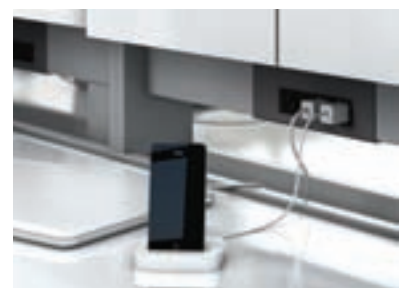
Power and data outlets are placed within arm's reach while an integral trough below the worksurface conceals excess cabling. Easy!