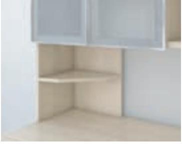
Overhead Cabinets may be supported by Corner Units with shelves (above) or Storage Modules (upper left).