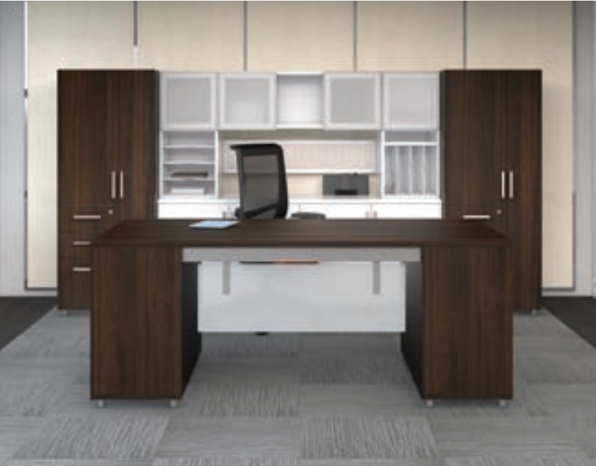
e5 makes even full-featured executive offices amazingly affordable. Worksurfaces, Pedestals and Wardrobe Towers in Columbian Walnut. Storage Cabinets, Overhead Cabinet with frosted glass doors and Support Modules in Designer White. Commute™ Chair in Flection Tango fabric.