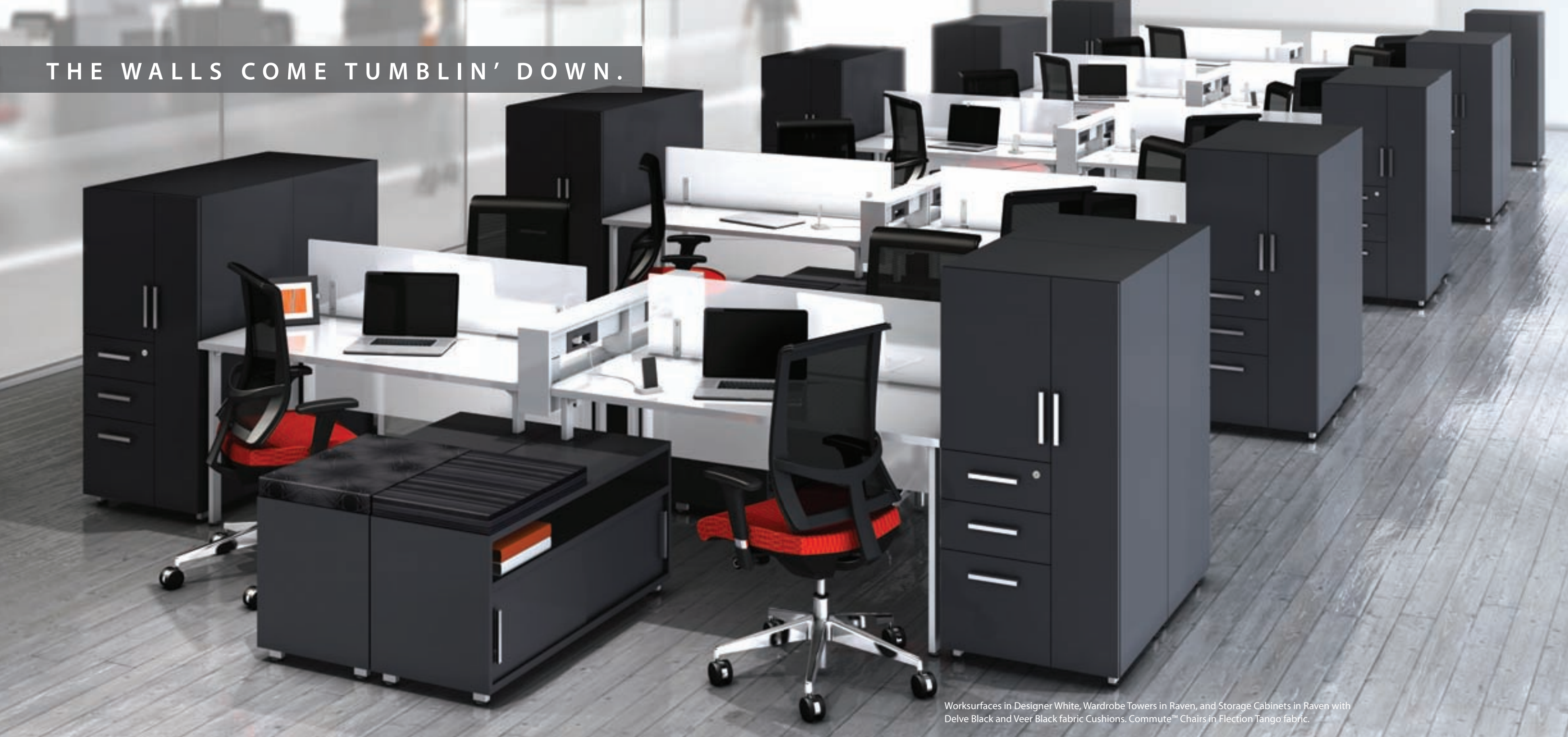
Worksurfaces in Designer White, Wardrobe Towers in Raven, and Storage Cabinets in Raven with Delve Black and Veer Black fabric Cushions. Commute™ Chairs in Flection Tango fabric.

More and more of today's workplaces require a level of collaboration that panel systems just won't allow. e5 delivers the space-saving footprint and expansive power capabilities of a panel solution in an environment that promotes interaction, without the isolating walls.