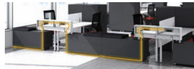
Power is routed from the source and up to the worksurface via our innovative Technology Beltway. Power kits can be added and reconfigured any time, with virtually no tools required.

Easy-to-Power features include Technology Beltways and a variety of 8-wire/4-circuit Power Kits that will accommodate even the most tech-intensive environments.