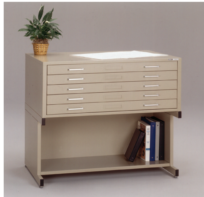
5-drawer C-File (7867) on 20" high base (7877)

Whether the need is for active or archival storage of drawings, C-Files are the perfect fit! Structurally, they provide the greatest protection and value of any plan file on the market.