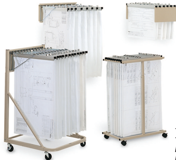
Top Left: Pivot Wall Rack (9304) Top Right: End-resting Wall Rack (9312) Bottom Left: Rolling File Stand (9329) Bottom Right: Expandable Plan Center (9429)

Mayline Vertical Clamp Files are the ideal choice for economical filing of active documents. Easy-to-use clamps grip sheets securely without punching or stapling. Mayline clamps and pivot hangers are designed to be interchangeable with the systems of other manufacturers for easy integration. Perfect for engineering and construction applications!