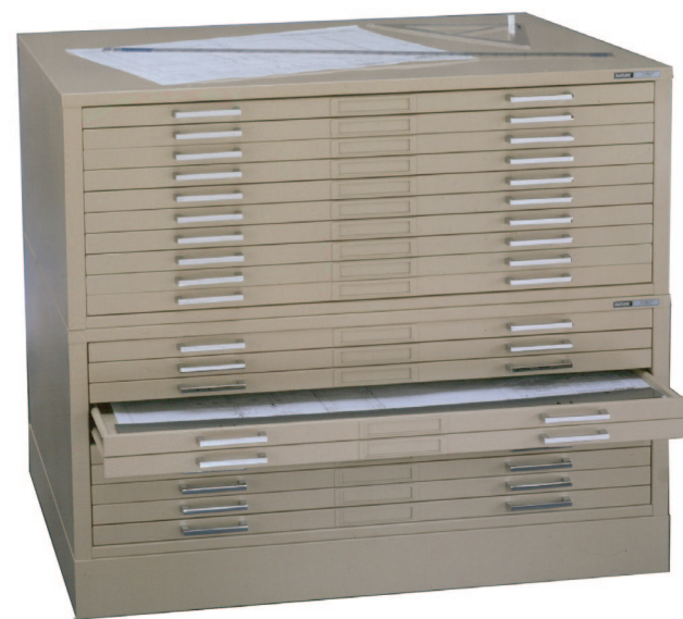
Double stacked 10-drawer C-Files ([2] 7977C) on 4" flush base (7867W)