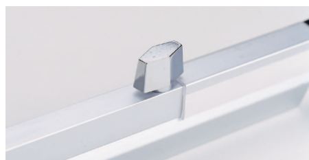
Metal wing knob