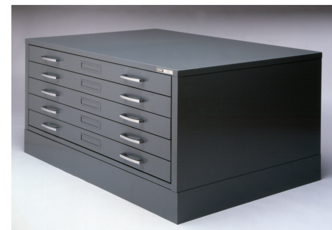
5-drawer Museum File (7667) with flush base (7967W)