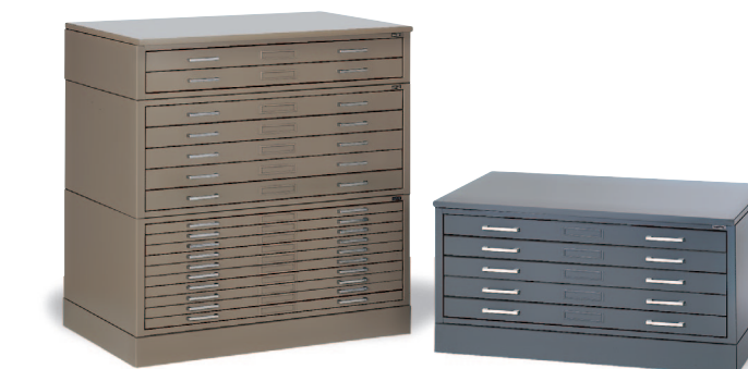
Interlocking Plan File with cap (7767U), 2-drawer file (7764), 5-drawer file (7767), 10-drawer file (7967) and flush base (7767W)

Both series of interlocking files are classic steel files recommended for storage of tracings, prints, charts, maps, or semi-active or archival reference drawings. The interlocking design and heavy-duty reinforced corner posts allow for ease of stacking up to five high on a flush base.