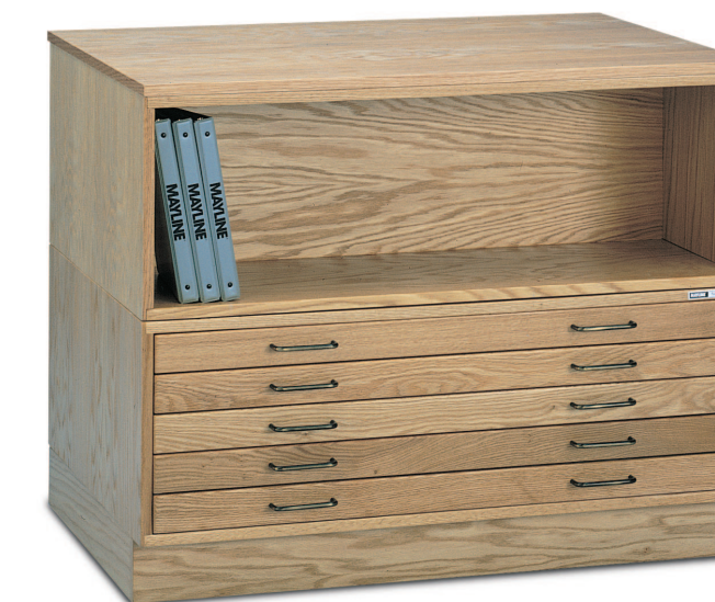
Wood Plan File (7717C) with bookshelf (7717S), flush base (7717W), and cap (7717U)

Mayline's Wood Plan Files combine a natural beauty and finish with the strength and durability of hardwood construction. Wood Plan Files offer form, function and warmth in any office setting. Only select cuts of kiln-dried oak are used to provide quality construction and strength.