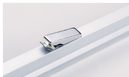
Spring-loaded metal mounting clips