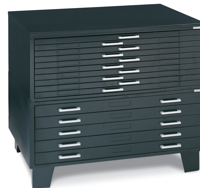
10-drawer (1J100) and 5-drawer (1J15) models interlocked on a 6" base (7890X) with cap (1J1)