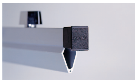
Double-toothed grip for superior holding power