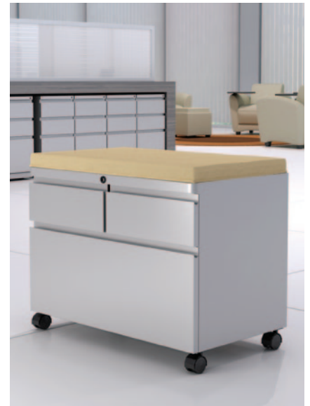
Mobile File Centers with cushions provide lockable storage and serve as casual seating for quick collaborations.