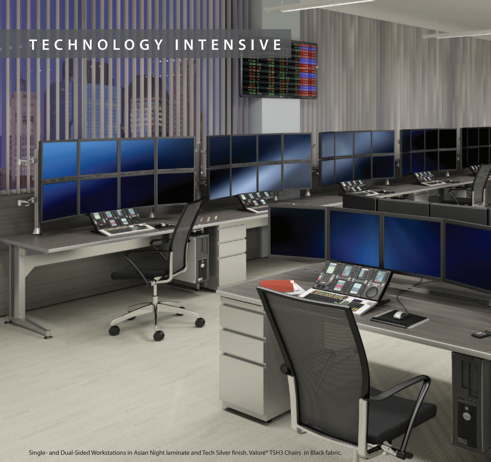
Single- and Dual-Sided Workstations in Asian Night laminate and Tech Silver finish. Valoré® TSH3 Chairs in Black fabric.