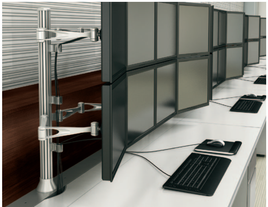
User-friendly arms allow easy adjustment of heights and viewing angles on flat-screen monitors. Keyboard and mouse platforms are also available.