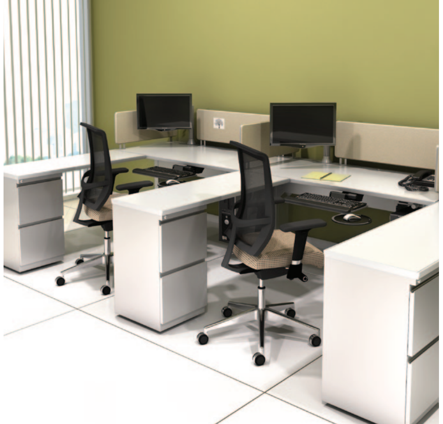
Single-Sided Desks and Returns in Designer White laminate with Pedestals in White finish. Tackboards in Crosstown Ray fabric. Commute™ Chairs in Expo Latte fabric.