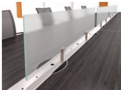
Frosted Acrylic Privacy Screens boast flame-polished edges to give the appearance of glass.