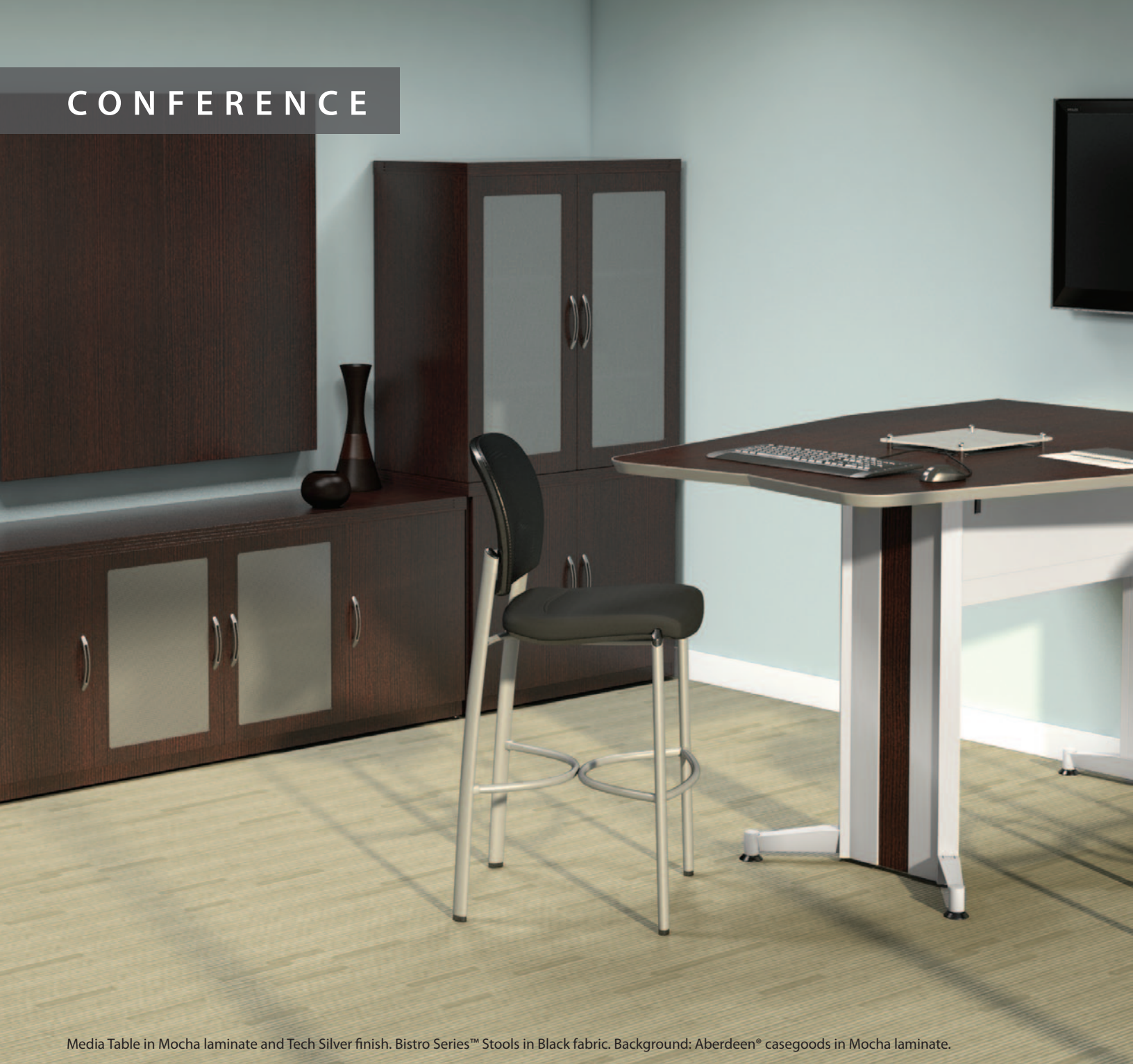
Media Table in Mocha laminate and Tech Silver finish. Bistro Series™ Stools in Black fabric. Background: Aberdeen® casegoods in Mocha laminate.