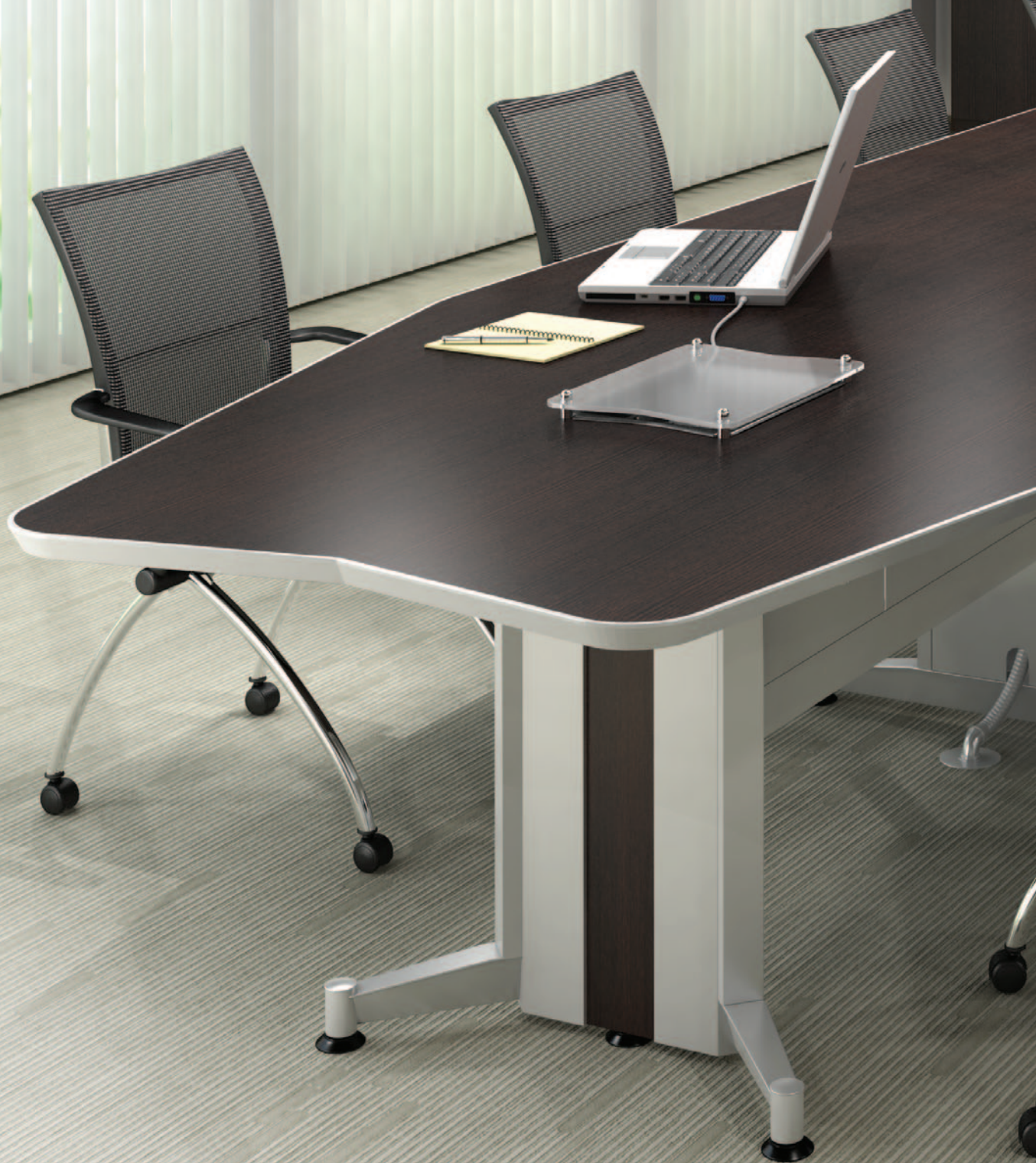
Conference Table in Mocha laminate and Tech Silver finish. Valoré® TSH1 Chairs in Black fabric. Background: Aberdeen® caseloads in Mocha laminate.