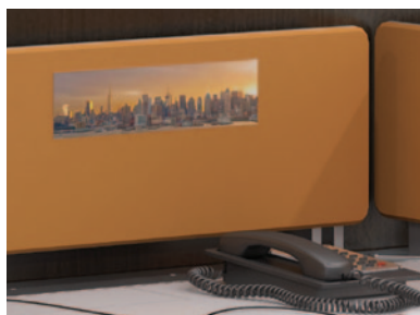
Tackable, eco-friendly Privacy Panels are offered standard in all Mayline corporate fabrics.