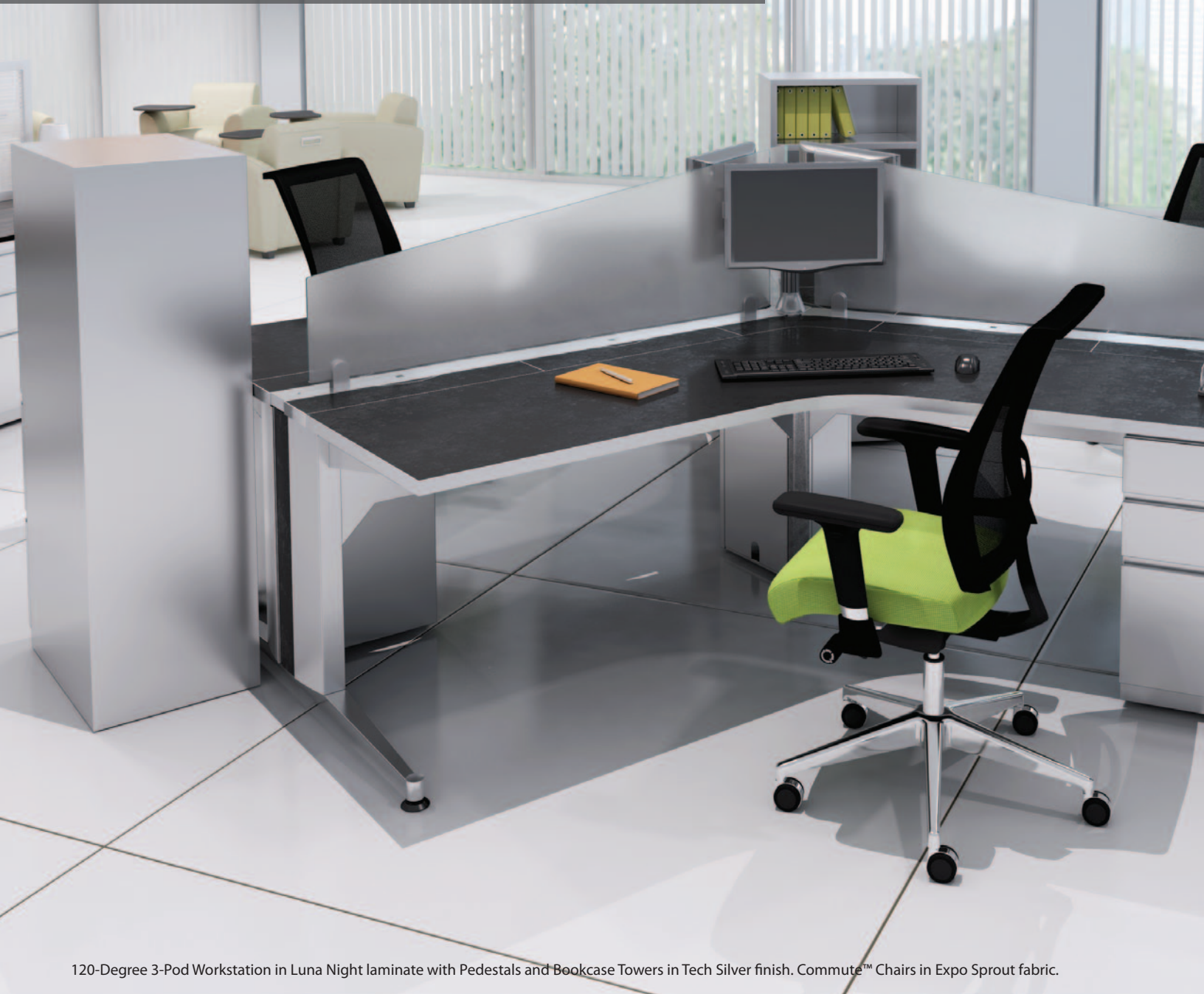
120-Degree 3-Pod Workstation in Luna Night laminate with Pedestals and Bookcase Towers in Tech Silver finish. Commute™ Chairs in Expo Sprout fabric.