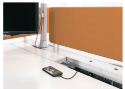
Removable surface panels on both sides of technology trough allow direct access to power/data.