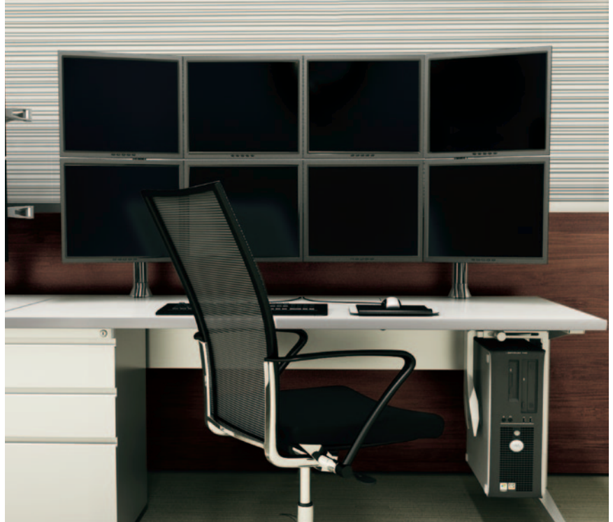
Rugged aluminum posts with articulating arms securely support up to eight flat-screen monitors per user. A CPU Holder can be mounted underneath the desk.