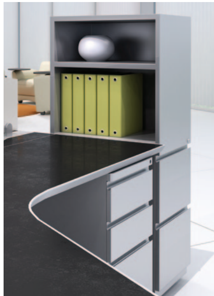
Bookcase Towers incorporate two adjustable shelves and a choice of two pedestal configurations.