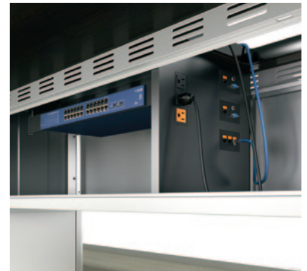
Table troughs can be outfitted with optional rack mount, VGA and custom plate options.

Cords route horizontally through an under-surface trough and vertically within the table leg.