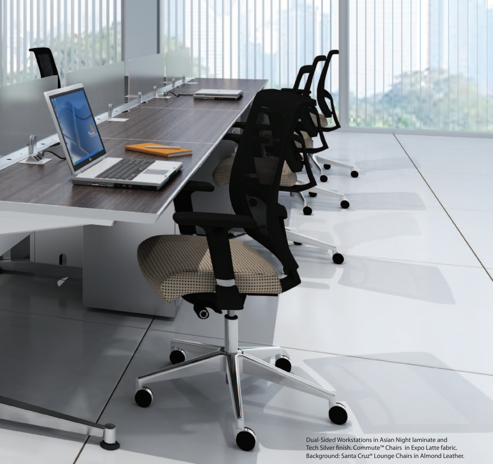
Dual-Sided Workstations in Asian Night laminate and Tech Silver finish. Commute™ Chairs in Expo Latte fabric. Background: Santa Cruz® Lounge Chairs in Almond Leather.