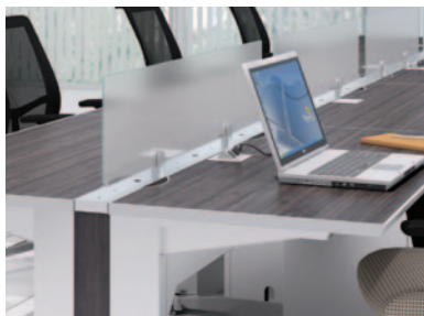
A technology trough routes power and data to worksurface outlets for convenient access.