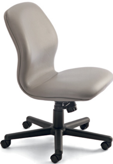
Low back chair 383 EZ (20") / 393 EZ (23")