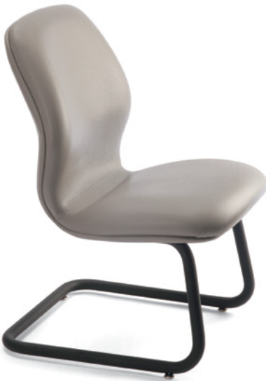
Guest chair 382 BB (20") / 392 BB (23")