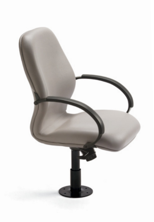
Mid back with EZ-Tilt control, hoop armrests and auto-return, non-height adjustable seat on jury base.