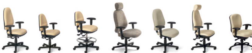
Task and Operational Seating