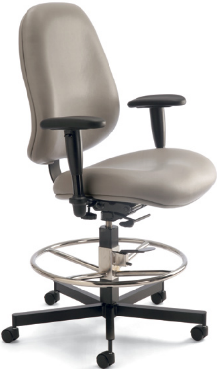
24" wide chair, tall stool height, XtremeDuty control, extended, steel standring, extended, steel base and adjustable height and width armrests.