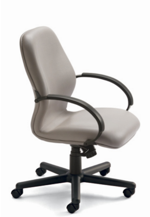
Mid back chair with arms 388 EZ (20") / 398 XD (23")