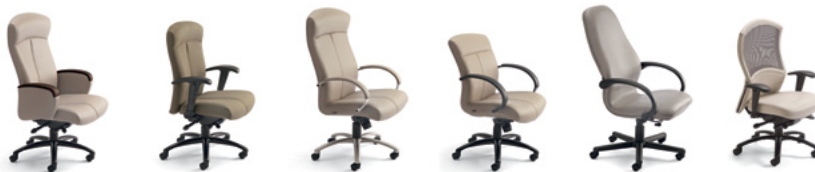
Management, Executive and Conference Seating