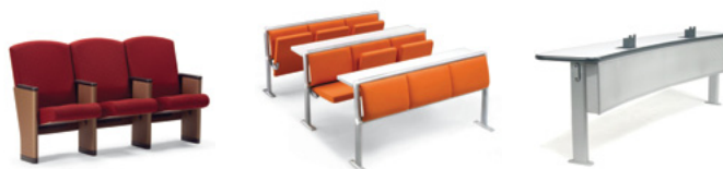
Auditorium and Public Seating

For further information on our comprehensive range of seating please visit our website or call our toll free number. Specifications are subject to change without notice.