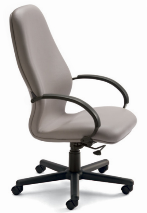
High back chair with arms 389 XD (20") / 399 XD (23")