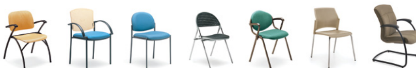
Occasional and Stacking Chairs