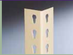
SUR Heavy Upright Post

Match posts with your needs: Use SUR posts for your most demanding applications. Use EUR for light or medium weight applications and in conjunction with ZTP posts. Use ZTP as an intermediate common "T" post.