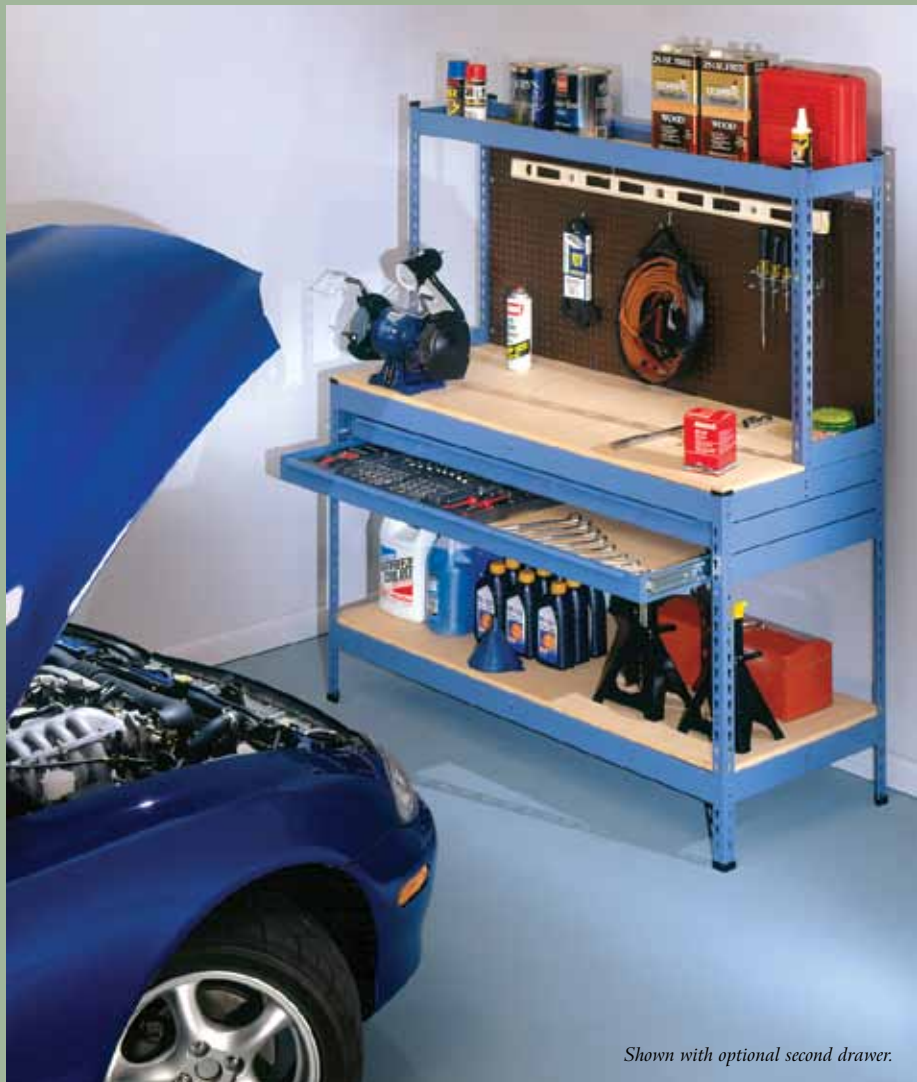
Shown with optional second drawer.

Industrial grade particle board shelves with steel frames offer 1,000 lb. capacities per shelf. Choose between a full-width drawer unit with a riser, drawer, and shelf or a half-width drawer unit with a riser, drawer, lower shelf, which accommodates sitting space. Both benches are available in Accent Blue paint finish only.