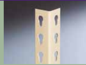
EUR Standard Upright Post