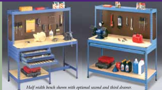
Half width bench shown with optional second and third drawer.

Versatile Storage Accessible storage is within reach. Reversible riser shelf holds up to 750 lbs. (evenly distributed.)