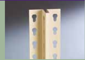
ZTP Intermediate Upright Post